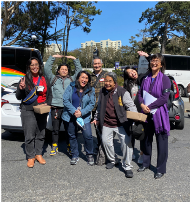
Sudents, faculty, and staff from San Mateo Community College District and Chabot College

Fortunately in Spring 2024, we made sure to tailor our campus visits to the needs of each school site, focusing on building community, learning more about financial literacy skills, and having students participate in a campus-wide acceptance day.